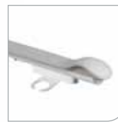
Attachment for signal device 80303027