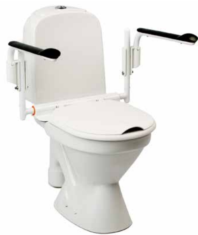
Lid and seat ring are included

Adjustable to fit both adults and children.