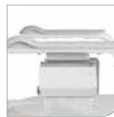
Toilet paper holder 83030001